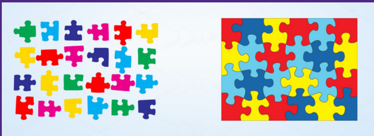
FIGURE 1: Diversity and inclusion

Inclusion is involvement and empowerment, where the inherent worth and dignity of all people are recognized. An inclusive organization promotes and sustains a sense of belonging; it values and practices respect for the talents, beliefs, backgrounds, and ways of living of its members.